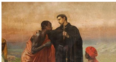
Memorial of St. Peter Claver, September 9

St. Peter Claver was born at Verdu, Catalonia, Spain, in 1580, of impoverished parents descended from ancient and distinguished families. He studied at the Jesuit college of Barcelona, entered the Jesuit novitiate at Tarragona in 1602 and took his final vows on August 8th, 1604. While studying philosophy at Majorca, the young religious was influenced by St. Alphonsus Rodriguez to go to the Indies and save "millions of perishing souls."