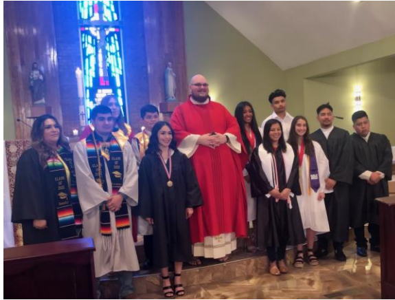
Congratulations, Class of 2021!